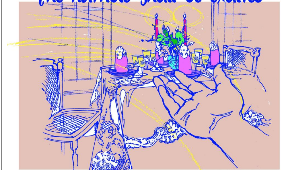
© 2006 J. S. Paluch Company, Inc.