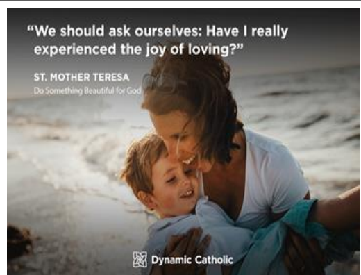
ST. MOTHER TERESA Do Something Beautiful for God